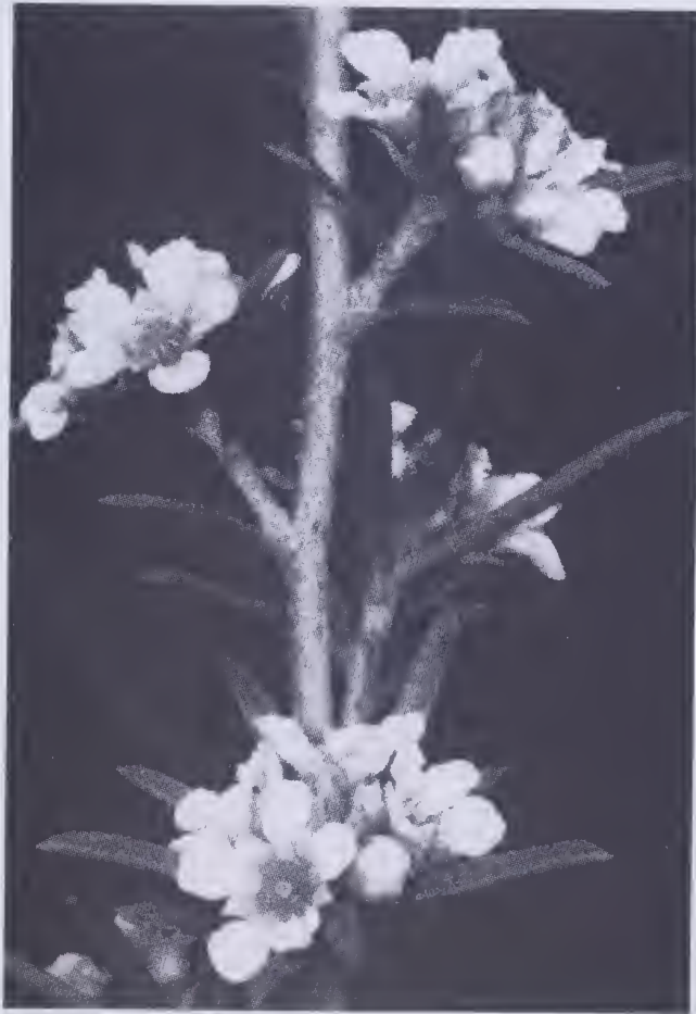
Figure 2. Photograph of flowering branch of Agonis fragrans.

Selected specimens examined (all PERTH). WESTERN AUSTRALIA: Walpole–Nornalup National Park point 305, 3 May 1989, A.R. Annels 732; Plot 5022, Romance Rd, 2 km N of Break Rd, 28 km NW of Denmark, 20 Nov. 1991, A.R. Annels 2006; Payne Rd, c. 4.5 km E of Bussell Highway, c. 14 km NE of Cowaramup, 31 May 1995, B.J. Lepschi 1867 (duplicates AD, BRI, CANB, NSW, US all n.v. ); Storry Rd off Pemberton–Nannup road adjacent to private property on Donnelly River, State Forest Jasper, 23 June 1991, N. McQuoid 171; Site B53, 600 m along unnamed track off Nanga Rd, 500 m N of intersection with Willowdale Rd, 24 July 1997, G. Paull 248; N side of Kernutts Rd, 1.3 km E of Denmark–Mount Barker road and 3.6 km N of Albany–Denmark highway, 29 Jan. 1998, C.J. Robinson 1208; Peter Buxton's property, Plantaginet Location 6634 Redmond West Rd, 18 km WSW of Redmond townsite (cultivated from locally collected seed – oil voucher), 18 Feb. 1998, C.J. Robinson 1213; 135 mile post on Albany Highway (between Williams & Kojonup), Oct. 1966, W. Rogerson 292; Site 133, 2.5 km SE of Mt Johnstone, 4 Sep. 1997, D. Trenowden 195; Gum Link Rd, W of Nornalup Rd, 10 Aug. 1991, J.R. Wheeler 2667; Walpole–Nornalup National Park, Nut Rd, 1 Sep. 1991, J.R. Wheeler 2939; Walpole–Nornalup National Park, 0.5 km E of Deep River bridge, track opposite Meredith Rd, 10 Aug. 1992, J.R. Wheeler 3098.